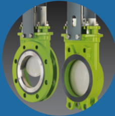
Knife Gate Valve