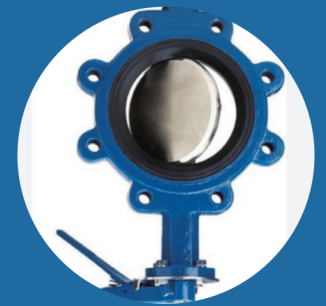
GATE GLOBE CHECK VALVE