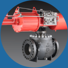
Trunnion-mounted Ball Valves